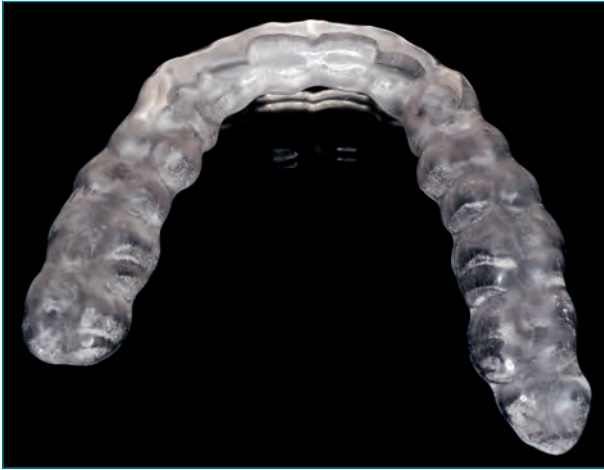
Fig. 5 Splint polished to a high luster.

A key issue, however, could be the materials' properties, for which adequate long-term evidence is still unavailable. While one type of splint is milled from a homogeneous block of material (subtractive procedure), the other type is built up layer by layer from a resin solution (additive procedure). To what extent this might influence any relevant properties of the material from which the splint is made, such as fracture behavior or long-term abrasion stability, remains to be determined by laboratory testing and clinical trials.