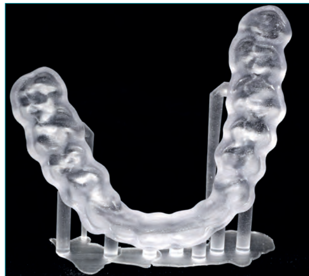
Fig. 3 Cleaned splint on a carrier plate.

The supporting structures are separated and light-cured to final hardness using the Otoflash G171 xenon flash-curing device by NK-Optik (Baierbrunn, Germany) (Fig. 4). This requires 2 \times 2,000 flashes of light while rotating the object in a protective atmosphere (nitrogen 5.0). This is a crucial step to ensure biocompatibility and to avoid the formation of an inhibition layer on the splint's surface.