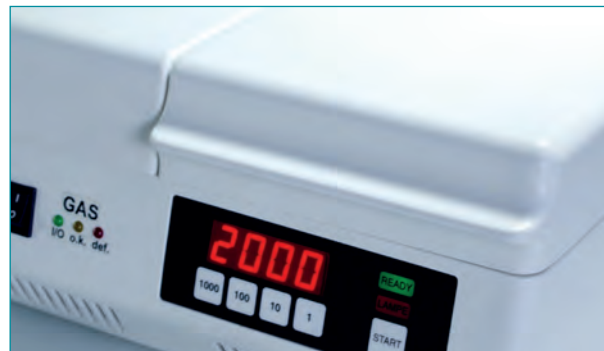
Fig. 4 Otoflash G171 xenon flash-curing device.

The workpiece can now be returned to the cast. Given adequate experience in splint design and a proper fabrication approach, minimal – if any – finishing will be required. If the clinical procedure that resulted in the working materials and documents was performed diligently, the effort required to adjust the static and dynamic occlusion will be equally minimal.