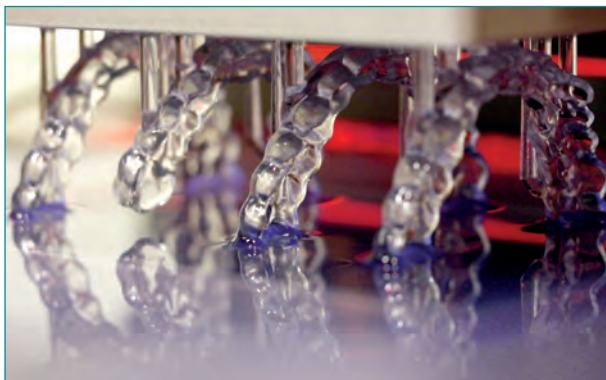
Fig. 2 Splints in the 3D printer.

An economic approach is to design the splints during the day and print them overnight, facilitating speedy delivery in cases where splint therapy becomes necessary on short notice, such as in acute TMD distress.