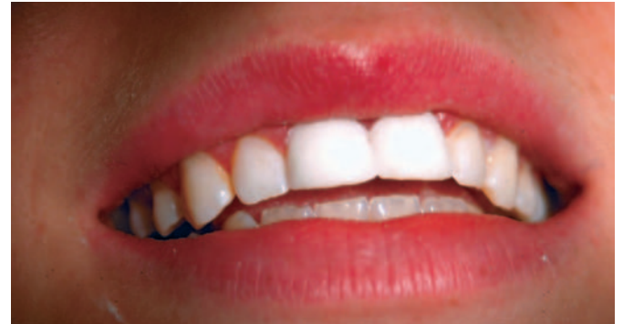
Fig. 6: After it is cured, the temporary veneer is trimmed and polished – here is the result. We have never obtained this result so simply and fast with any other material...

A quite important point: smartprotect® does not change the fitting accuracy of the preparations at all – the product does not form a film!