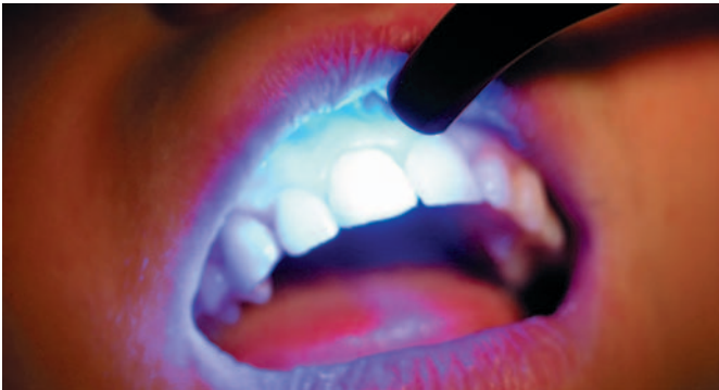
Fig. 5: After forming – here of a veneer – tempofill®2 is cured by the polymerisation lamp for 20 seconds. Production of the temporary filling for the veneer took only a short time.

And one further advantage: tempofill®2 releases continuously a small amount of calcium fluoride, this sedates and protects the abraded teeth.