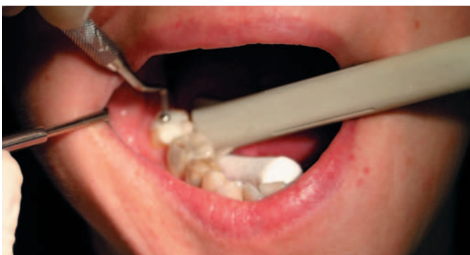
Fig. 2: tempofill®2 is applied directly by means of application syringe and shaped with the aid of a suitable instrument – as is also used for the filling technique. Its very pasty consistency simplifies the work, and the material does not stick to the instrument...

DETAX, the well-known manufacturer of intelligent dental materials, has developed and brought onto the market a new temporary filling material that has been met with spontaneous acceptance. In practice we have not met before with a material so easy and completely unproblematic to work with (Fig. 2). Especially in