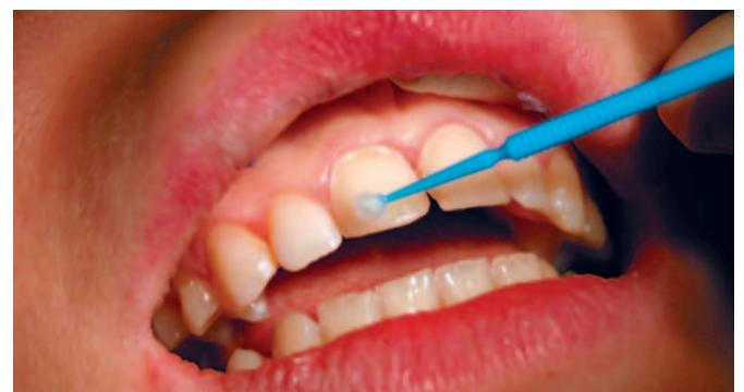
Fig. 4: For protection against hypersensitivity during the temporary filling, smartprotect® is applied. smartprotect® acts clinically like an insulator – the temporary filling can be removed very easily without firmly sticking residues.

tempofill®2 is used just like a filling material – here it is very expedient to use smartprotect® from DETAX as prophylaxis against sensations of pain (Fig. 4) – the material is applied directly and cured as required. Since one can also trim the prepared/unprepared transitions well, one has sufficient time – in contrast to cold-curing polymers. Consistency is just ideal: one can adapt and plug the material very well. Conspicuous shrinkage during polymerisation cannot be observed, at least in the practice test – and we have also found no signs of heat generation..