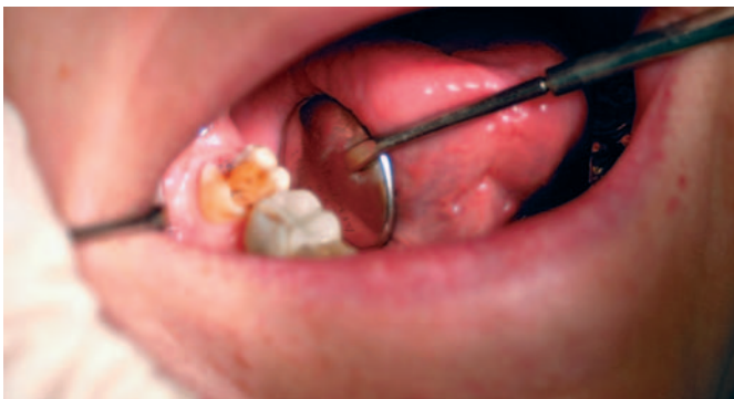
Fig. 1: The prepared cavity; a ceramic inlay should be produced. The temporary filling is made with the aid of the light-curing one-component tempofill®2 temporary filling material.

Everyone knows the problem: it is not unusual that producing adequate temporary fillings lasts longer than the preparation – this is annoying, even if the temporary filling is undertaken by the dental assistant (Fig. 1). The time spent on this is lacking elsewhere. Especially if the temporary filling should hold a little longer or if one wants to make veneers, then one is quickly at the end of the road with conventional temporary filling materials.